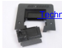
Technical floor air control (4)