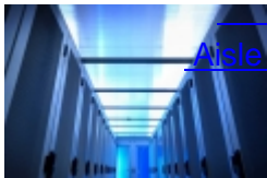
Aisle Containment (0)